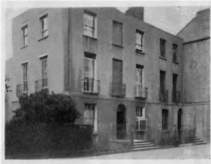
Laurel House, St. George's Place, (Near Free Library), Cheltenham.