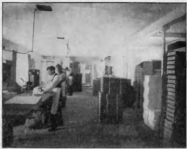
Salle or Finishing Room, Postlip Mills.

For many years the blotting-paper manufactured by Messrs. Evans, Adlard and Company, Limited, has been noted for its excellent